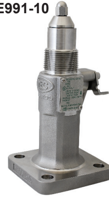
1-1/4" MNPT x 4 Bolt Flange Internal Valve