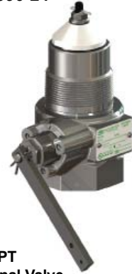
3" NPT Internal Valve