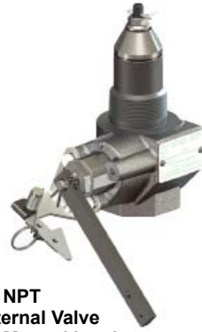
2" NPT Internal Valve w/ Manual Latch