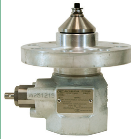
Modified Single Flange Series