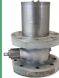
Standard Double Flange Series