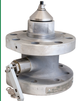
Modified Double Flange Series